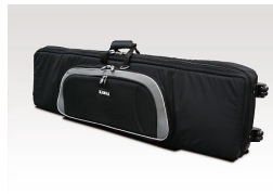
Gig-bag with castors