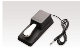
F-10H damper pedal