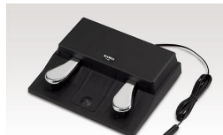
F-20 damper/soft pedal