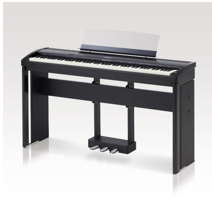
HM-4 designer stand, F-301 triple pedal (sold separately)